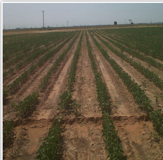
Black Label Zn + Accomplish LM