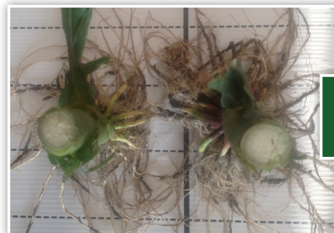
Larger stalk diameter