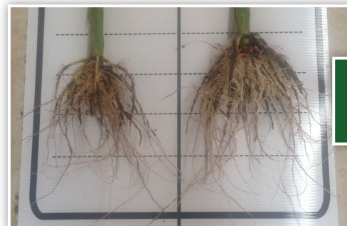
Increased root mass